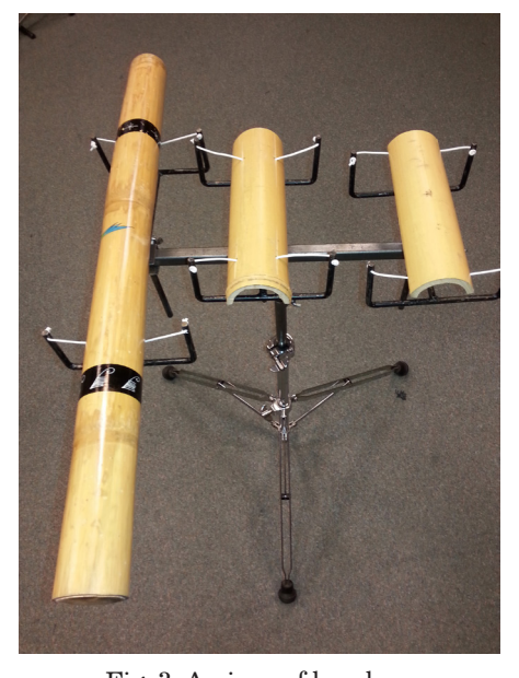
Fig. 3. A piece of bamboo.

Three painful bites, Nailed feet and hands O Jesus, remember me, When it is all done!