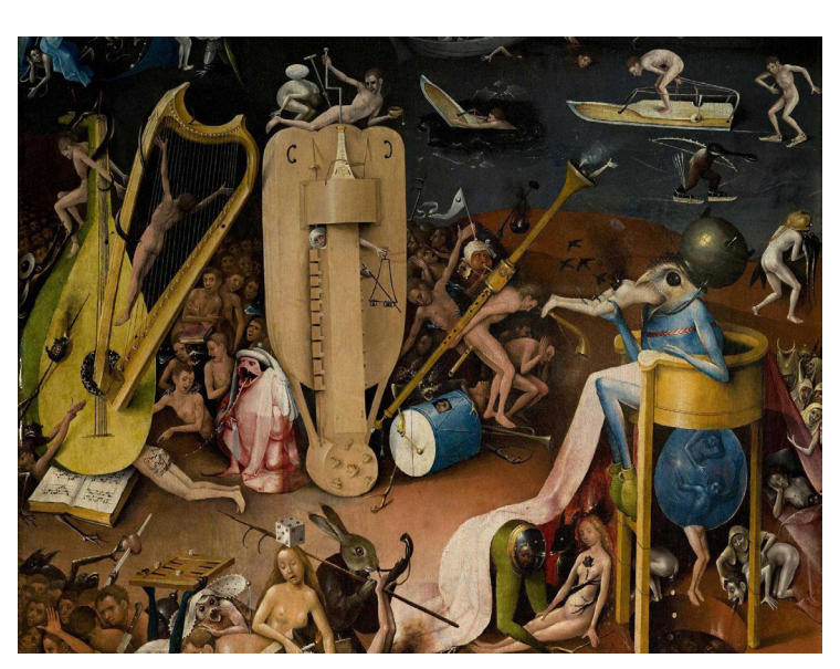
Fig. 1. Hieronymus Bosch, Garden of Earthly Delights.

meditate on the martyrdom of Christ<sup>5</sup>. On the other hand, percussion instruments, due to their large volume of sound, were the musical attribute of demonic forces in Christianity. Such a view was captured by medieval Dutch painter Jerome Bosh in his triptych Garden of Earthly Delights , made in oil on board.