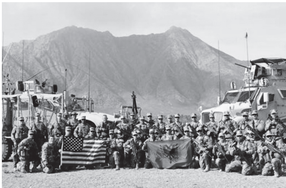
Figure 2. United States Soldiers in Albania

a “Mountain Warrior Task Force” to provide security operations throughout the region. Moreover, it was also announced that the military police of the US army will be stationed in Kosovo [ABD, Kosova’ya 200... ]. Besides, Kosovo demanded the acceleration of NATO membership and the establishment of a permanent US military base on its territory after Russia’s military intervention in Ukraine [ Kosovo Asks... ]. The Kosovo government, which has serious problems with the Serb minority in its country, also decided to increase the police capacity in the Serb-populated region in the north of the country [ Serbia Lashes Out... ]. It is among the possibilities that Albanian-Serb tensions will occur in the region in the coming period. The Ukraine Crisis has created a leverage effect on the “close of ranks” among ethnic elements in the Balkans.